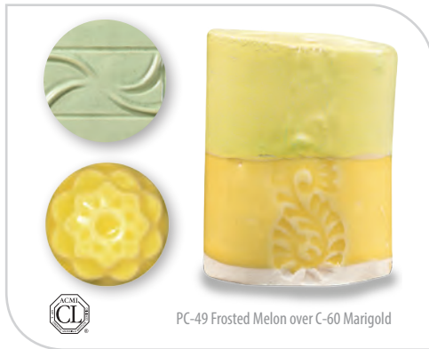
PC-49 Frosted Melon over C-60 Marigold