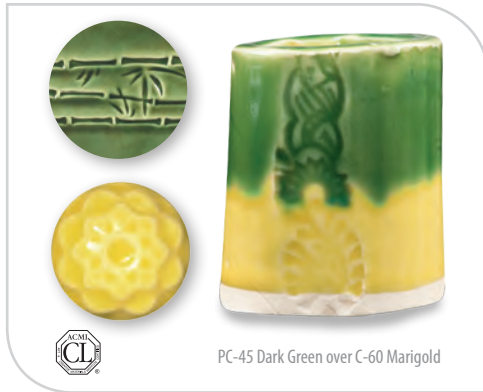
PC-45 Dark Green over C-60 Marigold