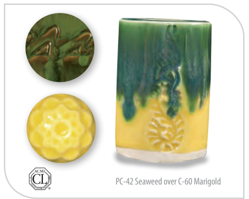
PC-42 Seaweed over C-60 Marigold