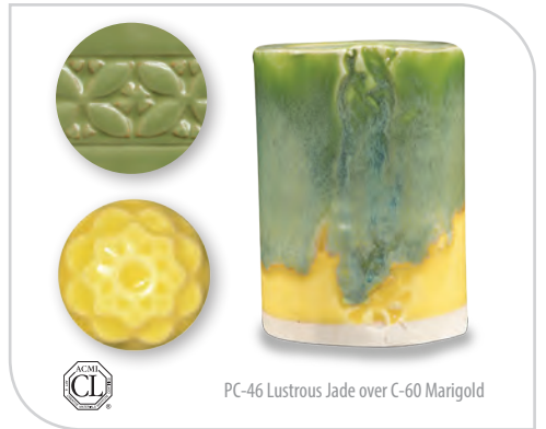
PC-46 Lustrous Jade over C-60 Marigold