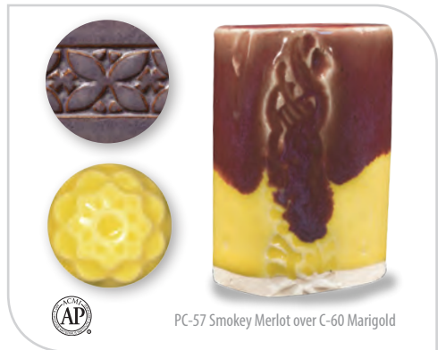
PC-57 Smokey Merlot over C-60 Marigold