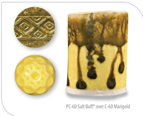
PC-60 Salt Buff* over C-60 Marigold