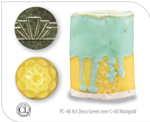
PC-48 Art Deco Green over C-60 Marigold