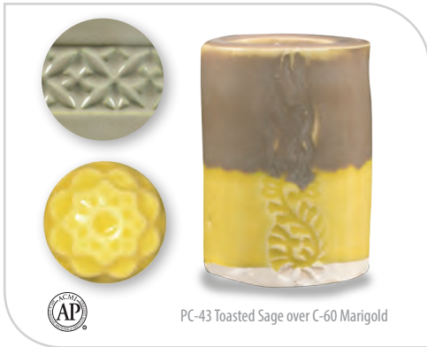
PC-43 Toasted Sage over C-60 Marigold