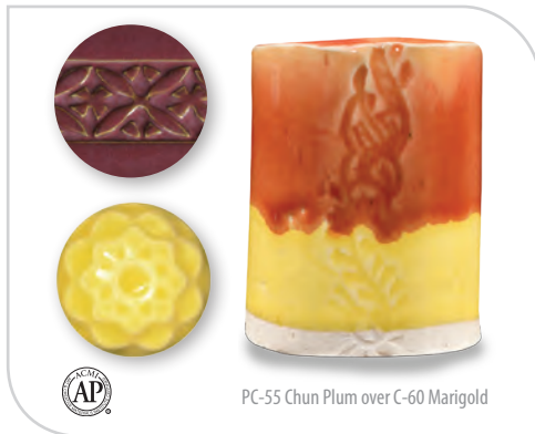
PC-55 Chun Plum over C-60 Marigold