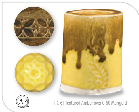
PC-61 Textured Amber over C-60 Marigold