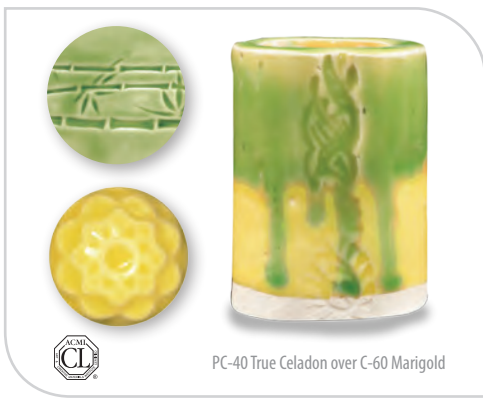
PC-40 True Celadon over C-60 Marigold