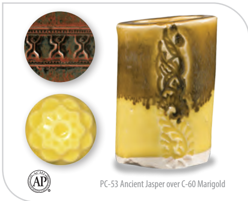
PC-53 Ancient Jasper over C-60 Marigold