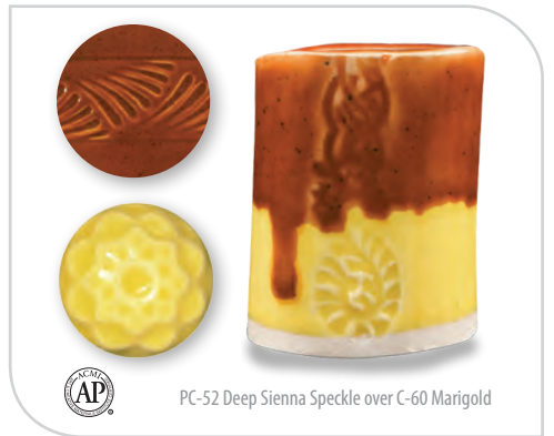
PC-52 Deep Sienna Speckle over C-60 Marigold