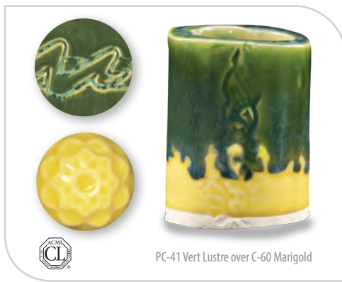
PC-41 Vert Lustre over C-60 Marigold