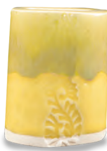
PC-32 Albany Slip Brown* over C-60 Marigold