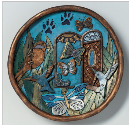
"Springtime" by Krissy Dutridge, Whitmer High School, Toledo, Ohio.

1. Students develop a design on paper that tells a story about an event in their lives, a vacation spot, an imaginary place, a dream, etc. The designs must include foreground, middle ground, and background and should include objects that are large, medium, and small. All designs must have objects that overlap in some areas and should have raised or built up areas that result from adding extra clay. Plates should have added objects that extend off the edges. The tiles should have a minimum of two horizontal curved lines to divide space and a minimum of three vertical or diagonal line elements. Line designs should extend across all tiles to reach edges.